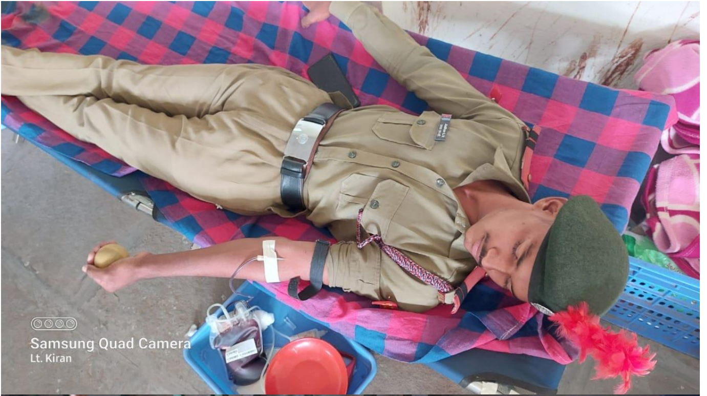
©©©© Samsung Quad Camera Lt. Kiran